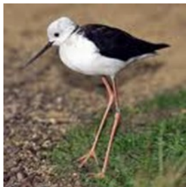
Black Winged Stilt