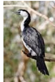
Little Pied Cormorant