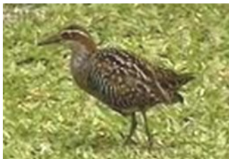
Buff Banded Rail