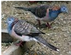
Bar Shouldered Dove

Put a tick, stamp or sticker in the box next to the picture of the birds as you see them.