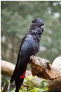
Red-tailed Black Cockatoo