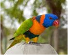
Red Collared Lorikeet

Put a tick, stamp or sticker in the box next to the picture of the birds as you see them.